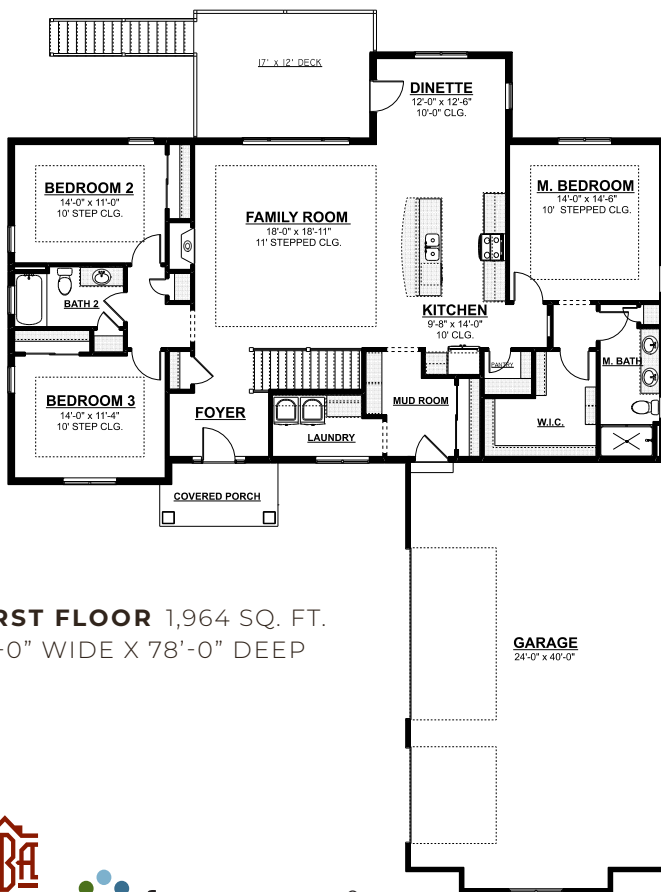
FIRST FLOOR 1,964 SQ. FT. 61'-0" WIDE X 78'-0" DEEP